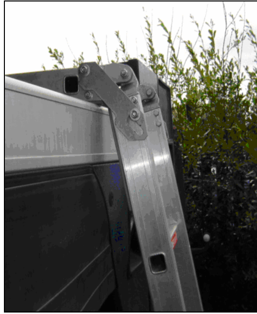
Fig. 6 - New Latch