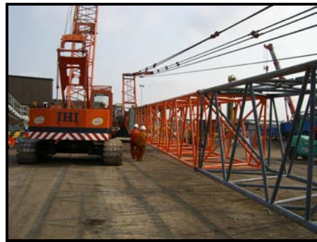
Fig. 2 – Extending Rope At Ground Level