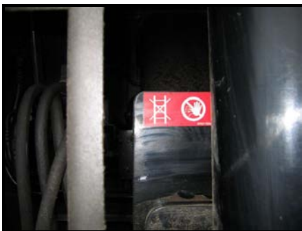
Fig. 3 - Additional Decals