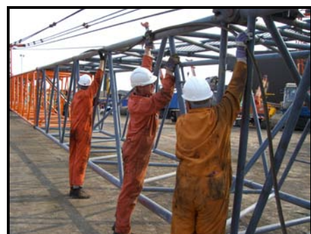
Fig. 6 – Lifting Rope Onto Jib