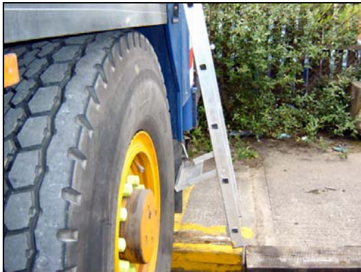
Fig. 7 - New Standoff