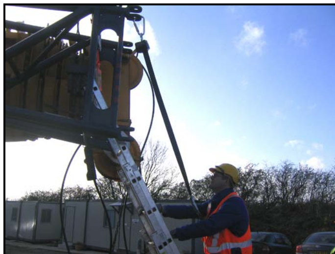
Figure 3 - Fall Arrest System

If it is not possible or appropriate to use collective or personal fall prevention or collective fall protection systems, personal fall protection should be used to mitigate the effects of any fall. This will generally be the use of personal fall arrest systems