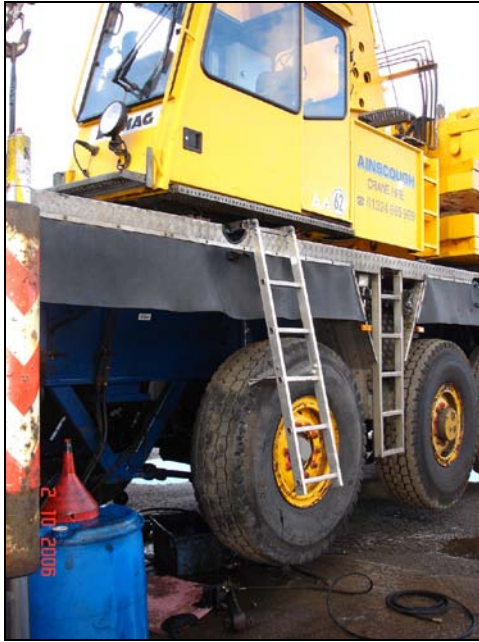
Fig. 5 - Another Manufacturer's Solution