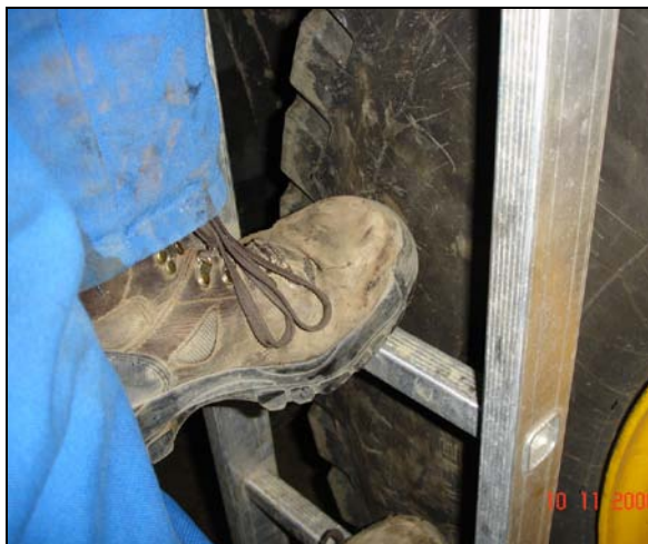
Fig. 2 - Insufficient Foot Penetration