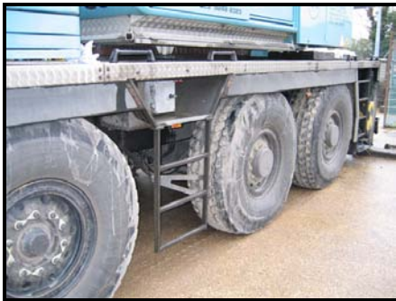
Fig. 1 - Additional Access Ladders