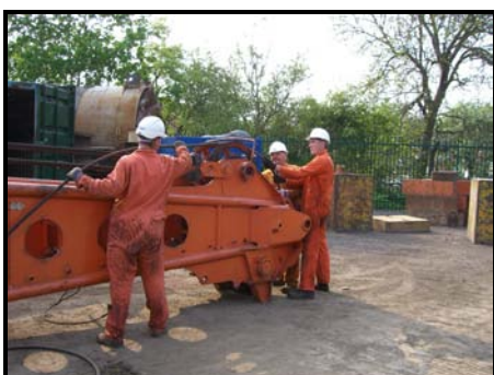
Fig. 5 – Rope Through Head Sheaves