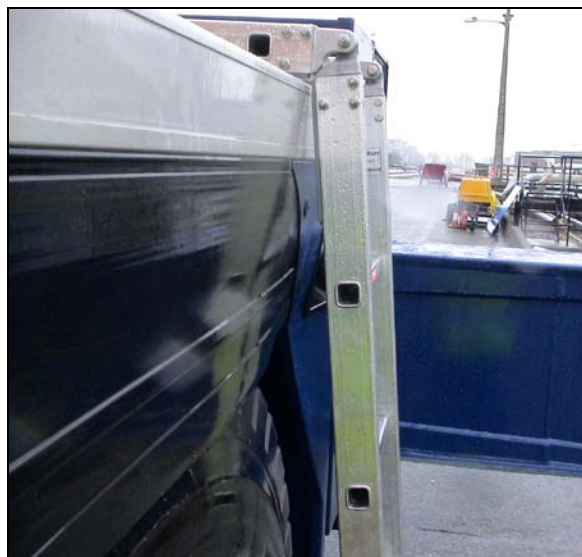
Fig. 4 - Original Ladder Hanging Freely