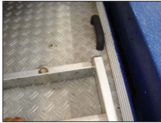
Fig. 8 - New Grab Handle