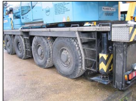
Fig. 2 - Additional Access Ladders