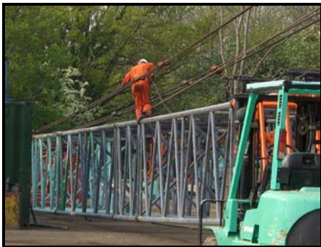
Fig. 1 – Previous Method