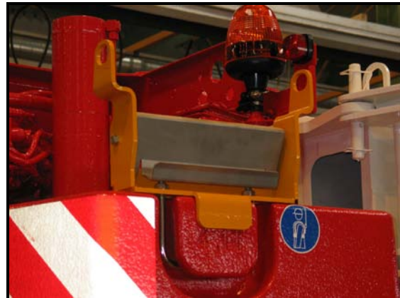
Automatic Ladder Latch with Anchor Point

Personnel using ladders must be adequately trained in the selection, use and pre-use checking of ladders. See Sections 11 and 13 .