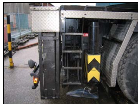
Fig. 4 - Decal Location