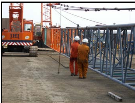
Fig. 3 – Extending Rope At Ground Level