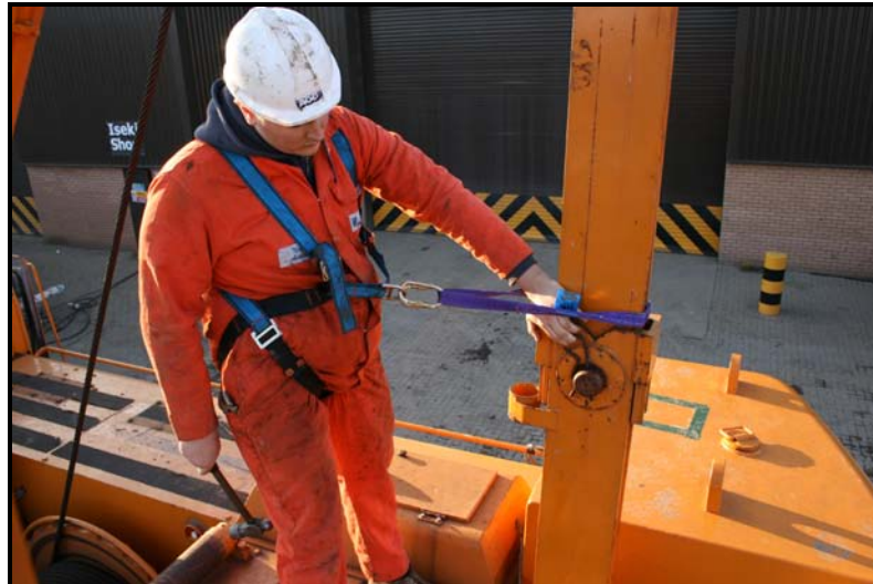
Figure 1 - Work Restraint System

Work restraint systems are designed to prevent personnel from reaching an unprotected edge and falling. By definition they restrain the wearer by restricting movement and may be of limited value when working on the crane structure.