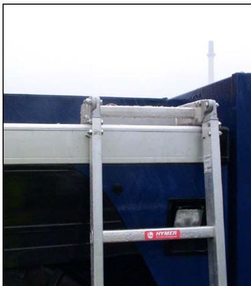
Fig. 3 - Original Ladder Swung Round From Stowage Position