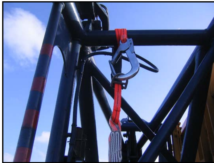
Figure 4 - Lanyard Shortening Device

Further information on “fall factors” is given in Clause 9.1.3.1 of BS 8437:2005 - Code of practice for selection, use and maintenance of personal fall protection systems and equipment for use in the workplace .