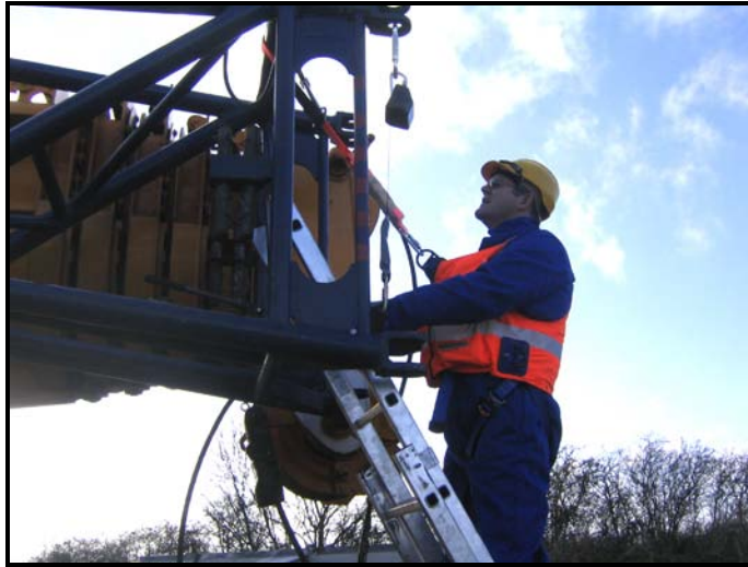
Figure 2 - Work Positioning System