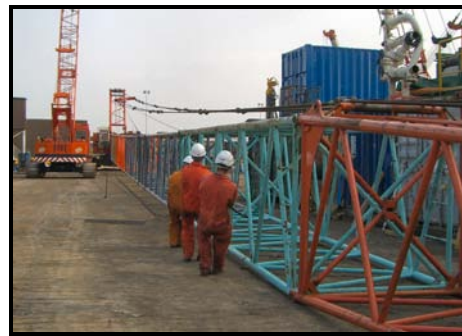
Fig. 4 – Bigger Team For Longer Ropes