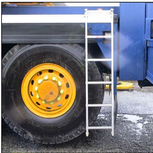
Fig. 1 - Original Freely Suspended Access Ladder